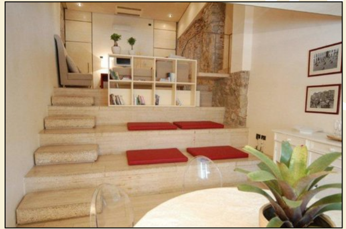
The Anfiteatro Elena - The Living Room