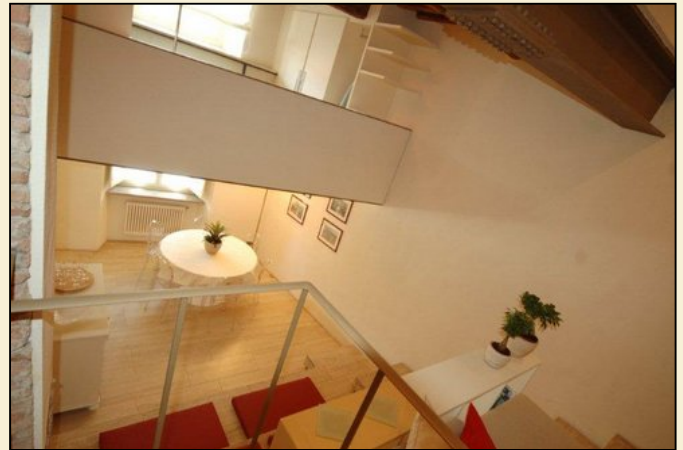
The Anfiteatro Elena - The Living Room