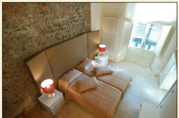
The Anfiteatro Elena - The Twin Bedroom