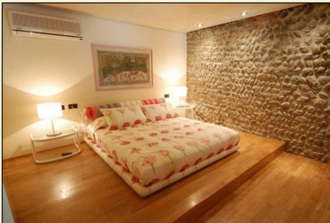
The Anfiteatro Elena - The Master Bedroom