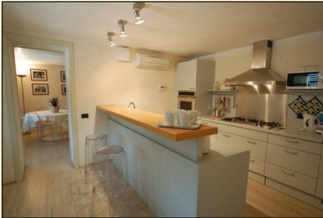
The Anfiteatro Elena - The Kitchen