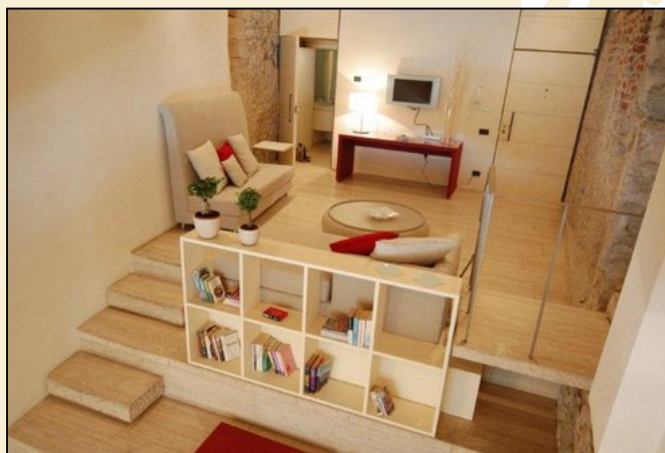
The Anfiteatro Elena - A General View