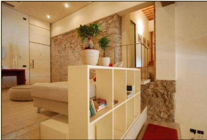
The Anfiteatro Elena - The Living Room