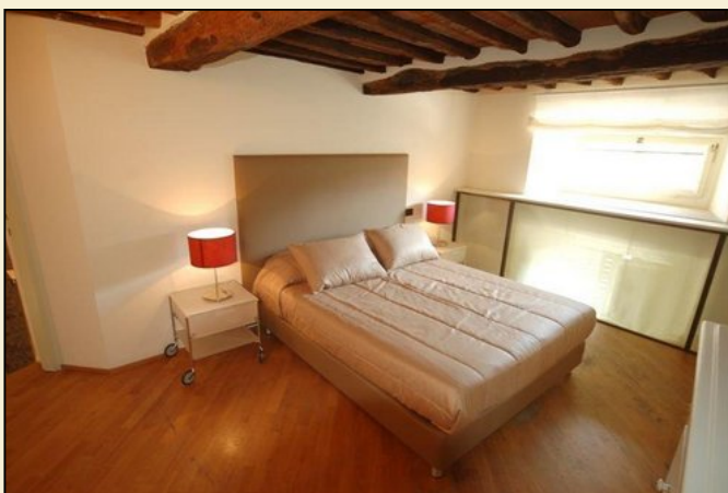
The Anfiteatro Elena - The Double Bedroo