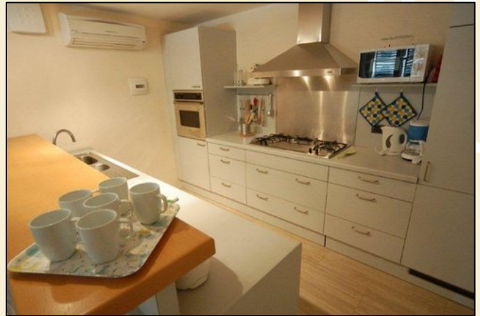
The Anfiteatro Elena - The Kitchen