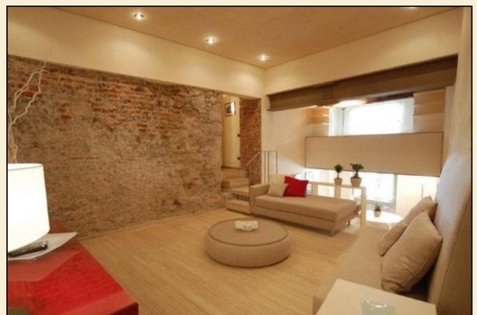
The Anfiteatro Elena - The Living Room