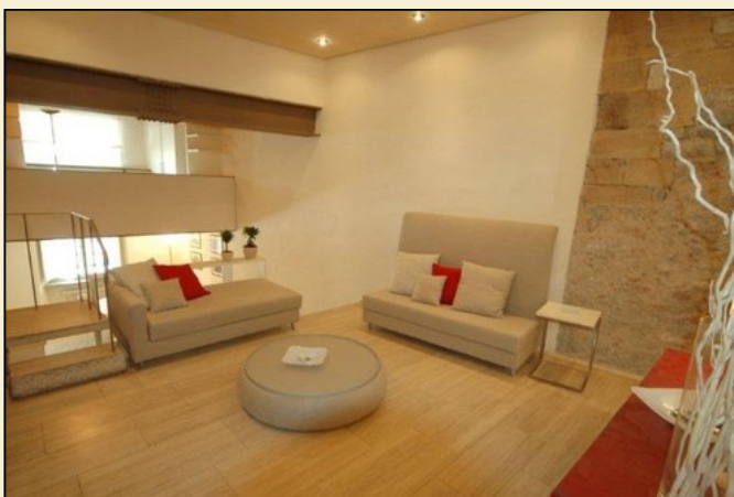
The Anfiteatro Elena - The Living Room