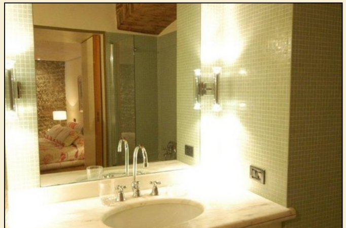
The Anfiteatro Elena - The Ensuite Bathr